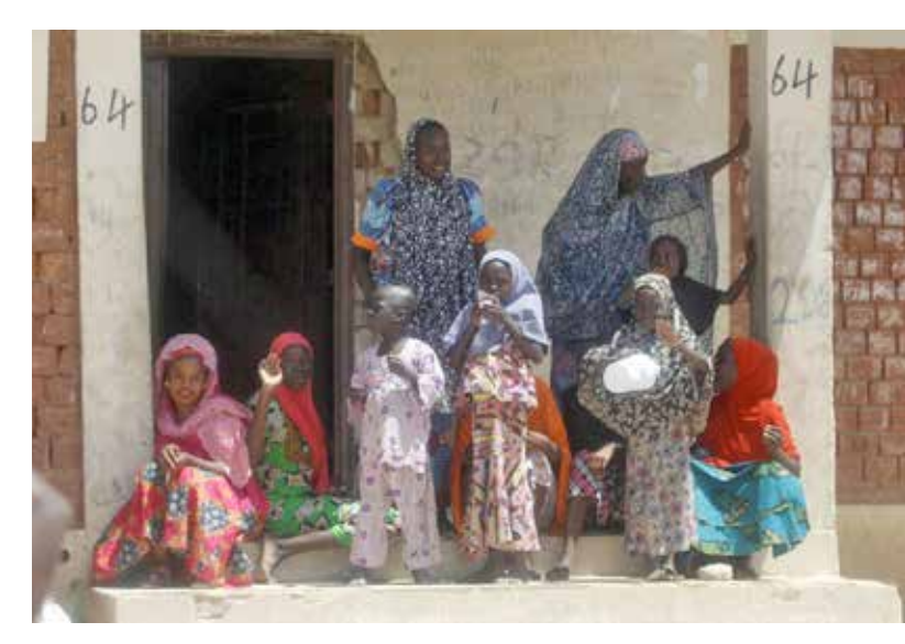
ABOVE: Residents of Teachers Village IDP Camp, Maiduguri, Nigeria, during a visit by a delegation of the UN Security Council. February 2017.

With XB resources, DPA provided technical support to ECOWAS-led mediation efforts in Guinea-Bissau throughout 2016, and supported the Mano River Union (MRU) to develop its capacity for cross-border management including