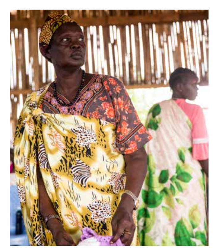
ABOVE: Women at a Protection of Civilian site in Juba, South Sudan. April 2016.

In 2016 XB funds made a significant contribution to the UN system's work on CRSV. For instance, XB funds enabled DPA to finance a Political Affairs Officer in the GPS unit to serve as DPA's focal point on CRSV, which is a core function of DPA's gender portfolio that could not be funded under the Regular Budget. DPA also co-facilitated the first ever Training-of-Trainers course on the DPKO-DFS Integrated Training Materials on the Prevention and Response to Conflict-related Sexual Violence in UN Peace Operations. This subsequently provided the basis for a pilot, scenario-based training on preventing conflict-related sexual violence organized jointly by UNSOM and the AU Mission in Somalia (AMISOM), that will be rolled out for AMISOM peacekeepers. XB funding also enabled DPA to provide technical expertise on the protection of women and girls, including CRSV. For example, XB resources enabled the GPS Unit to participate in an inter-agency task force on protection issues in Syria. In addition DPA, in partnership with the DPKO, DFS, OHCHR, and the Office of the SRSG on Sexual Violence in Conflict, con-