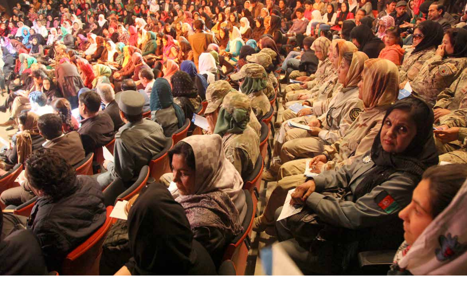
ABOVE: Commemorative event on the occasion of International Women's Day in Kabul, Afghanistan. March 2017.

In Libya, over the last year, the country has experienced increasing fragmentation and polarization of political and security actors. In this context, DPA supported UNSMIL in facilitating an inclusive dialogue aimed at overcoming obstacles to the implementation of the Libyan Political Agreement. Efforts centered on broadening the support base for the agreement and the bodies it created, including through sustained engagement with women, as well as improving the security situation. Despite the challenges, DPA's support has assisted parties in the partial implementation of the agreement and has helped ensure that most Libyan and international stakeholders support it as the only political framework for preventing a relapse into large-scale conflict. In addition, using XB funds, DPA supported several successful, local-level reconciliation initiatives.