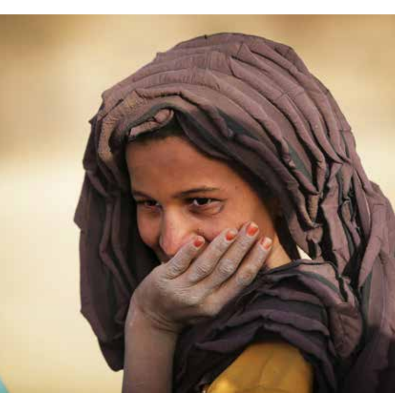
ABOVE: Young woman in Mali. February 2017.