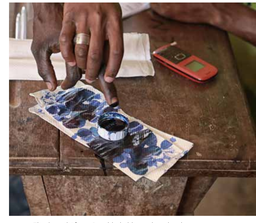
ABOVE: The Central African Republic held presidential and legislative elections on 30 December. An electoral officer helps a voter dip his finger in ink after casting his ballot. December 2015.

In 2016, DPA invested heavily in its partnerships with regional and sub-regional organizations, in line with key recommendations of the High-Level Panel on Peace Operations report. That report stresses the centrality of stronger global-regional partnerships for effective peace and security engagements. DPA has been developing long-term partnership frameworks that institutionalize such cooperation, and it relies on XB resources to maintain a number of its liaison presences.