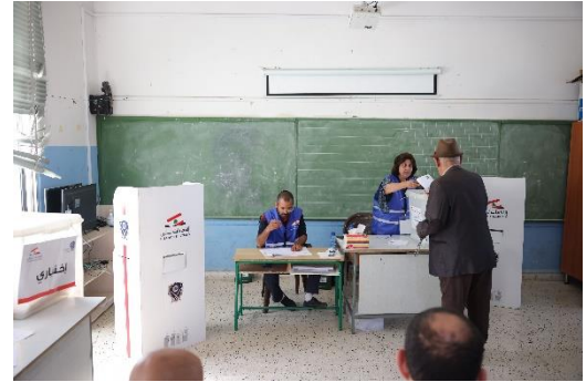
An election official hands a ballot to a voter during Lebanon's 2025 Municipal Council elections, supported by the Lebanese Electoral Assistance and Parliamentary Support Project (LEAP).

In Palestine, governance reform and credible elections remain central to future stability and any lasting peace. UNSCO continues to provide technical support to sustain institutional readiness and strengthen the capacity of the election management bodies should elections be scheduled or mandated. DPPA continues to work with the Palestinian authorities to advance governance reforms and lay the groundwork for a credible and lasting two-State solution.