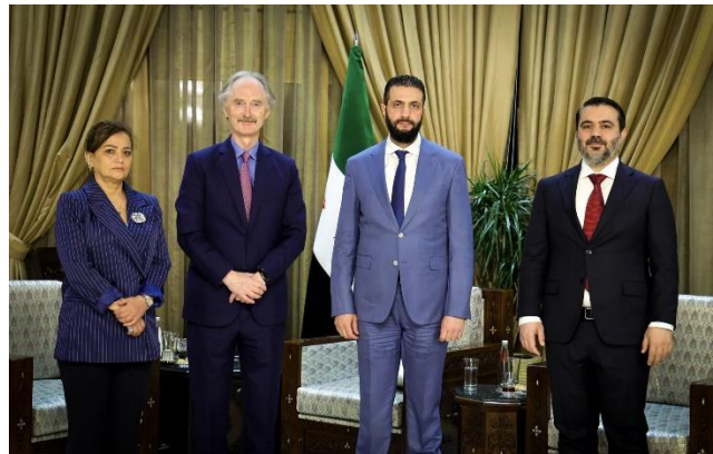
Special Envoy for Syria Geir O. Pedersen (center, left) and Deputy Special Envoy Najat Rochdi (left) meets with Interim President Ahmed Al Sharaa (center, right) and Foreign Minister Asaad Shaibani (right).