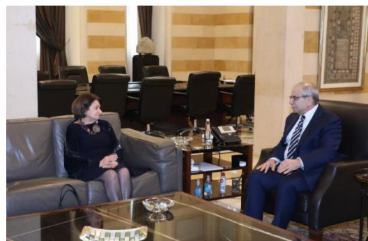
Under-Secretary-General Rosemary DiCarlo meets with Prime Minister and President of the Council of Ministers Nawaf Salam during her visit to Lebanon.

Flexible MYA funding enables rapid deployment of experts, political advocacy, and coordination on the ground, ensuring the UN can respond quickly, sustain inclusive processes, and lay the foundation for lasting peace.