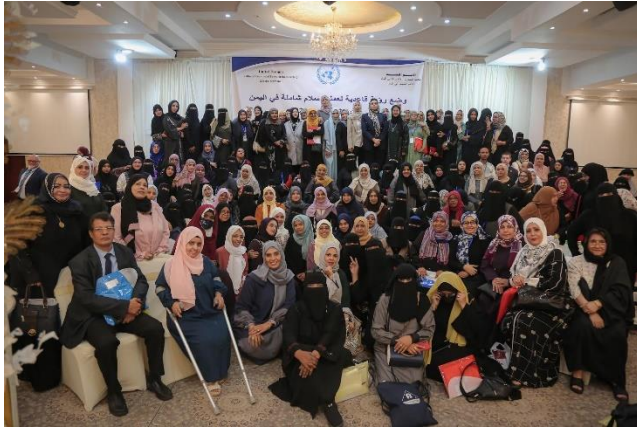
The Office of the Special Envoy for Yemen convenes a consultation in Aden, bringing together 200 women leaders and civil society actors from across Yemen to discuss their vision for an inclusive peace.