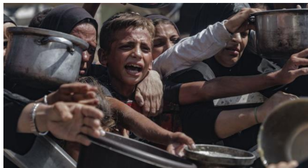
People wait for food at a community kitchen in western Gaza City.

DPPA will continue to work closely with the Palestinian Authority and regional and international partners to advance a viable path toward recovery and reconstruction in Gaza and towards a long-term political solution that realizes two States living side by side in peace and harmony. The Egypt-hosted International Reconstruction Conference, which the UN is supporting, will be a fundamental step in that direction. UNSCO's continued work with the Palestinian Authority to strengthen its capacities in a "whole of Palestine" approach is also fundamental for security and governance arrangements to be in place and for substantive progress toward the two-State solution.