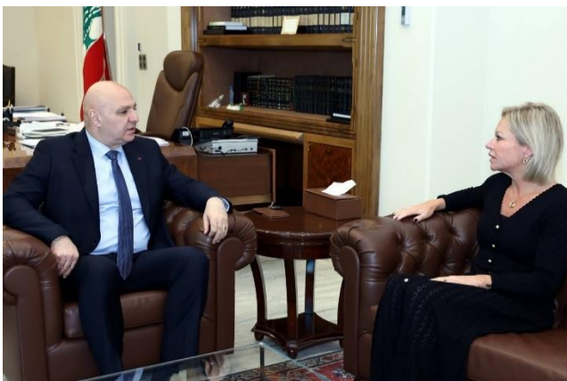
Special Coordinator for Lebanon Jeanine Hennis-Plasschaert (right) meets with President of Lebanon Joseph Aoun.

Yet, the election of a President and the formation of a government under a new Prime Minister offer an unprecedented opportunity to address the root causes of the conflict with Israel, including the maintenance of weapons outside of state authority and also the advancement of key reforms. DPPA, through the Office of the UN Special Coordinator for Lebanon (UNSCOL), plays a key role in de-escalating tensions, liaising with leaders in both Lebanon and Israel to work towards an end to violence and consolidation of peace and stability.